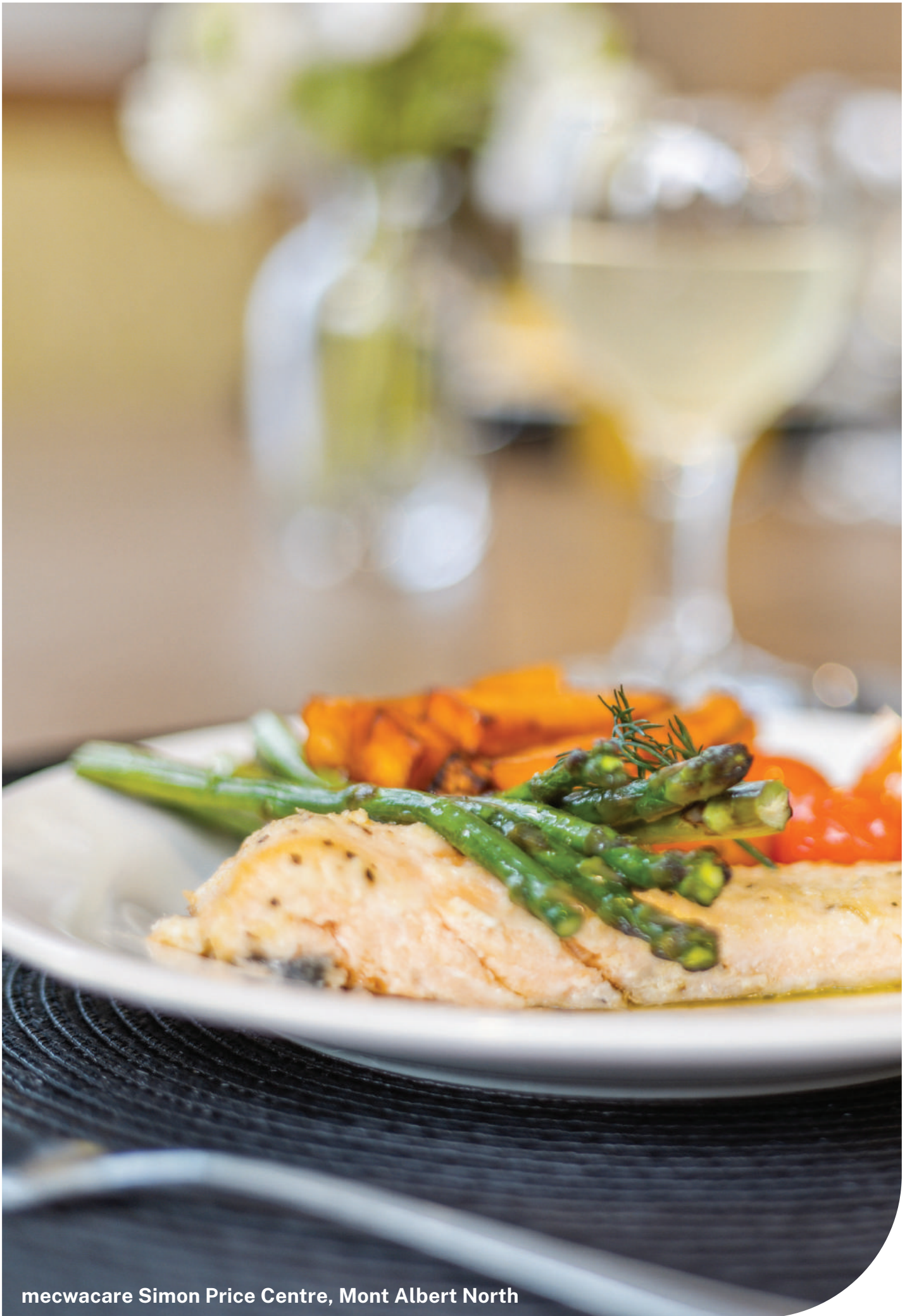
mecwacare Simon Price Centre, Mont Albert North