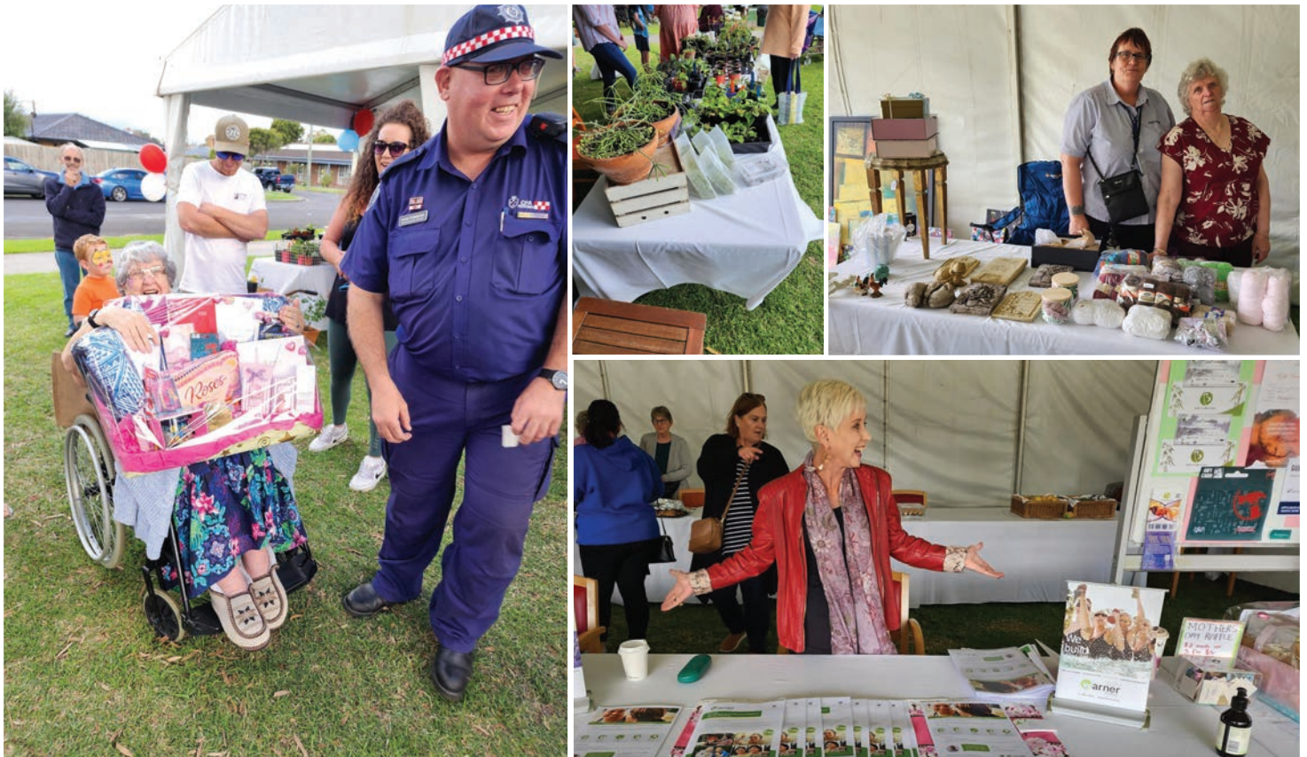
Photos: O'Mara House Mother's Day Market, Traralgon.

A community raffle added an extra layer of excitement, with lucky winners taking home a variety of prizes generously donated by local businesses. The funds raised will significantly aid the Traralgon SES and CFA in their critical operations, ensuring they can continue to protect and serve the community.