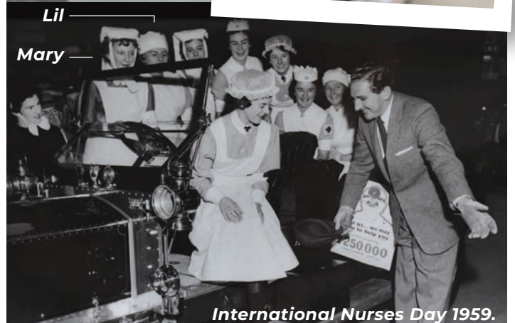
International Nurses Day 1959.