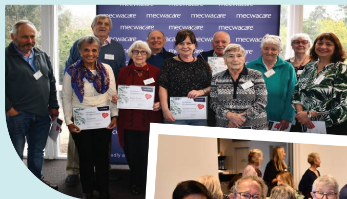
Our wonderful volunteers at mecwacare's annual Volunteer High Tea.

During this momentous occasion, we had the pleasure of presenting 34 Service Awards to those who have shown remarkable dedication and commitment. This included three remarkable volunteers who received their 25-year service award; an awe-inspiring achievement that inspires us all.