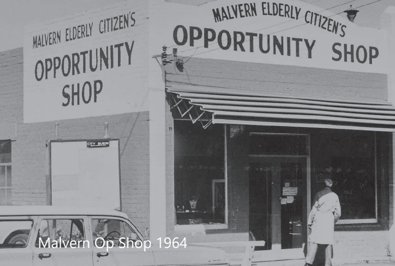
Malvern Op Shop 1964