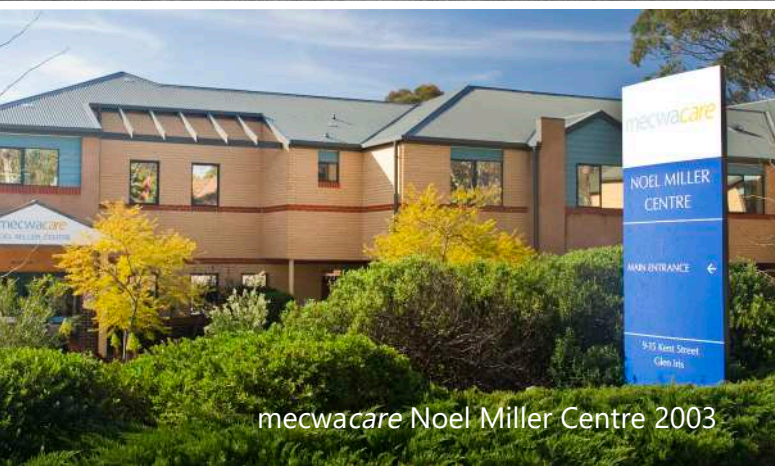
mecwacare Noel Miller Centre 2003

Community centres, Barry Fenton Centre in Malvern East and Rivendell House in Pakenham, offer programs for people with dementia, people with an acquired brain injury and older adults looking for social integration and inclusion. Increasing demand for services in the Cardinia Shire has also resulted in the expansion of Planned Activity Groups to Garfield, Koo Wee Rup and Emerald, and in 2020, San Remo and Phillip Island.