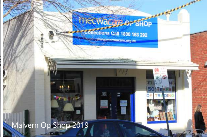
Malvern Op Shop 2019

In 2007, MECWA changed its name to mecwacare , which was representative of the organisation's focus as it grew into a larger care services provider across Melbourne and into regional Victoria.