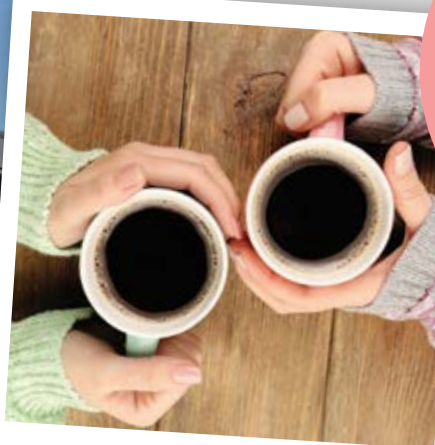
Stop by for a cuppa!