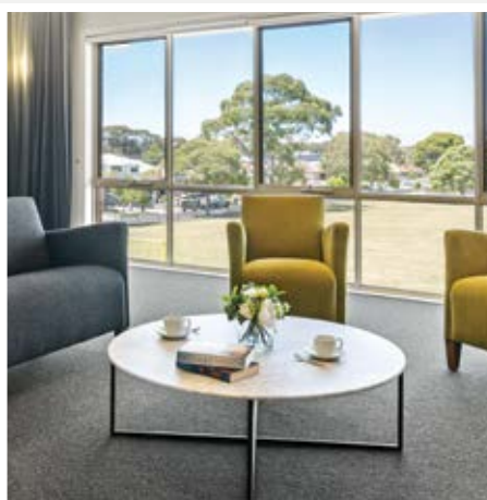
Squires Place, Altona North