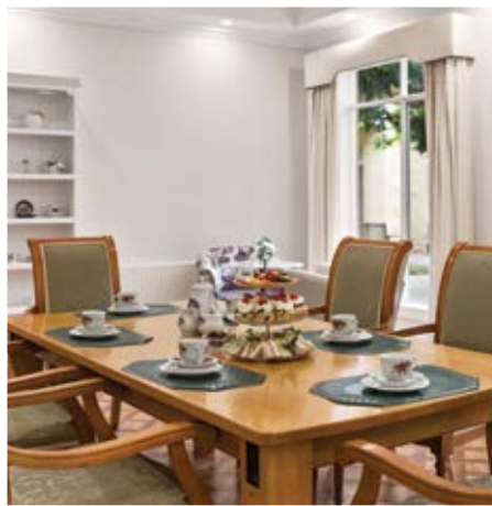
Calwell Manor, Safety Beach