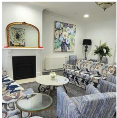
Annie's Court, Shoreham