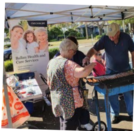
Ballan Auxiliary Sausage Sizzle

The Ballan Auxiliary team have a proud history of raising money to support the wonderful work of their local health and community services. Fundraising profits go straight back into the Ballan community.