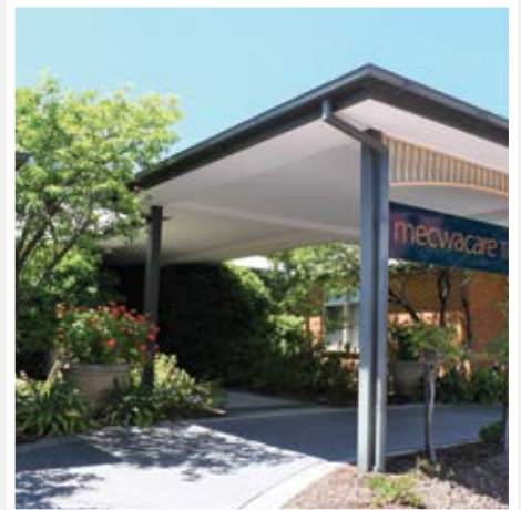
Trescowthick Centre, Prahran