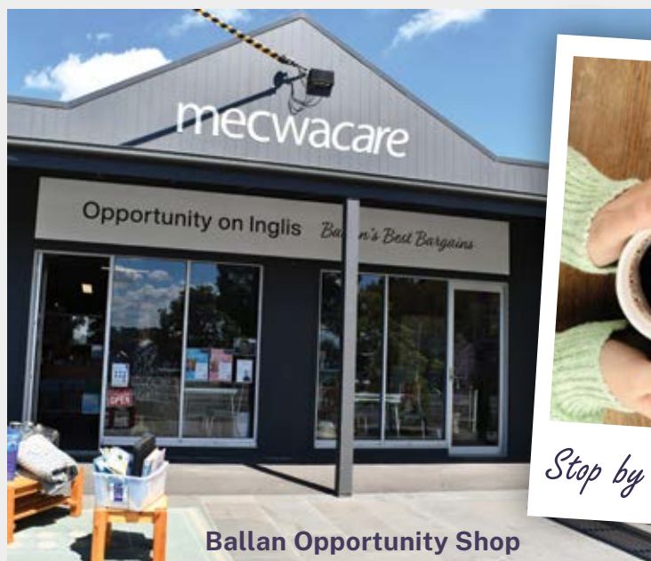
Ballan Opportunity Shop

The Ballan Auxiliary team have a proud history of raising money to support the wonderful work of their local health and community services. Fundraising profits go straight back into the Ballan community.