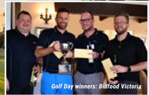
Golf Day winners: Bidfood Victoria